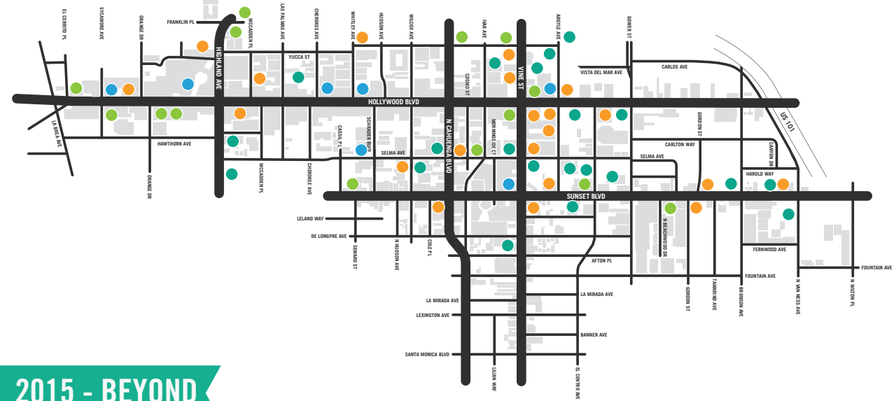
2015 - BEYOND